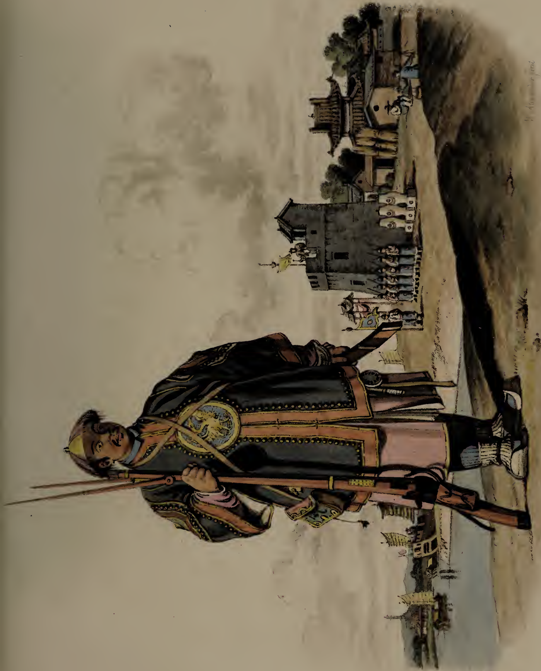
Lancaster Market on 1 st 1862 by W. Miller Old 13 and Street