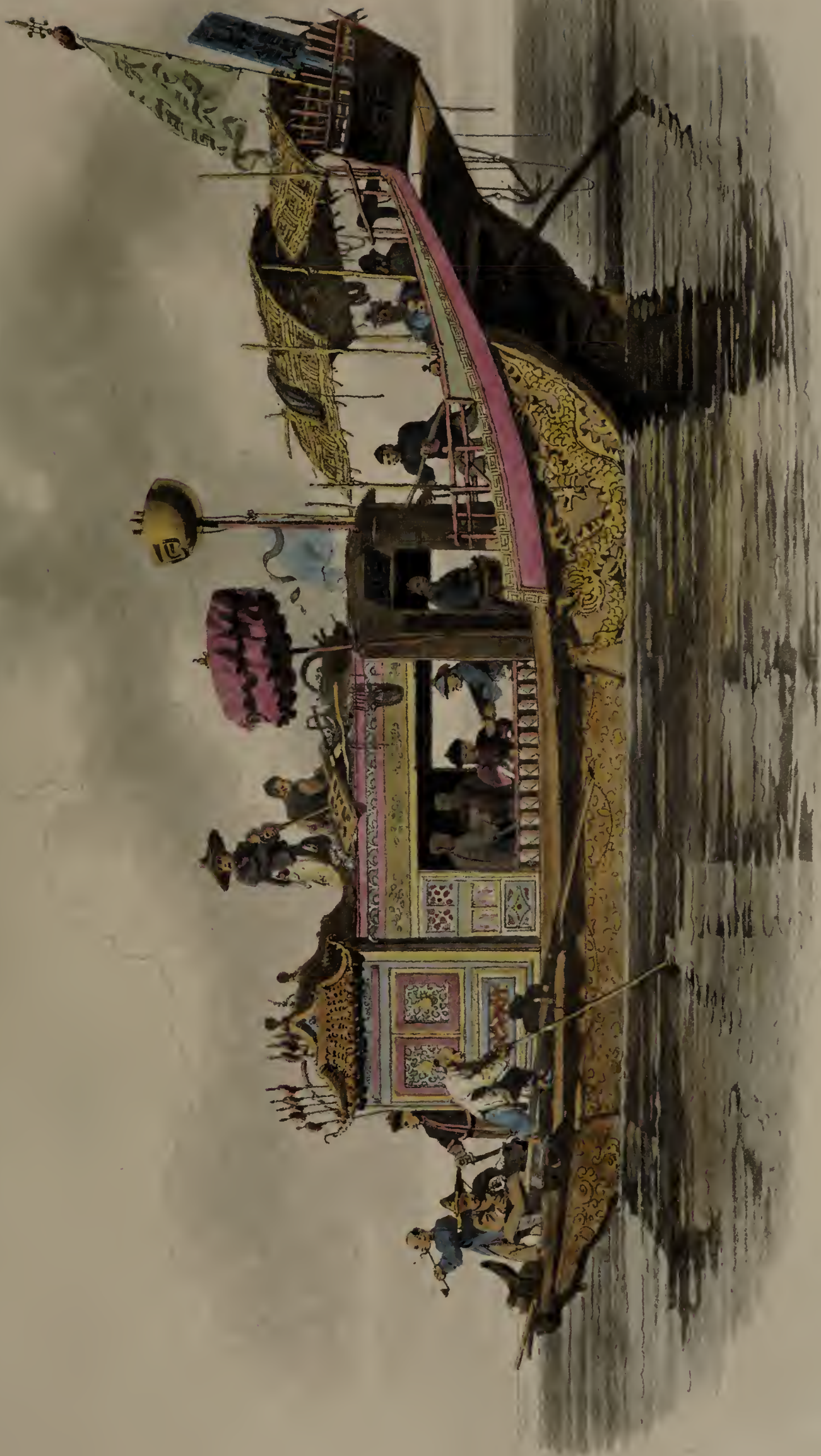
Small boat on the river