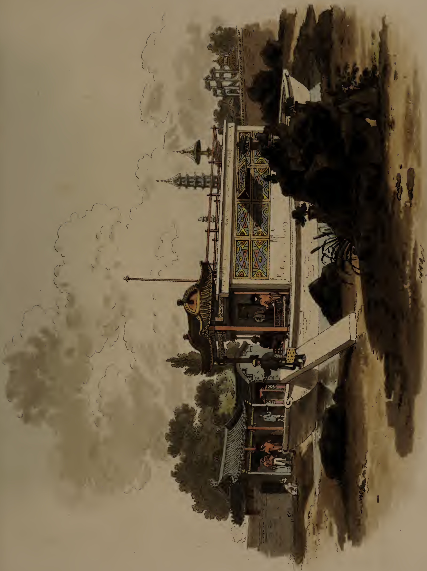
London Published Nov 1 st 1804 by W Miller Old Bond Street