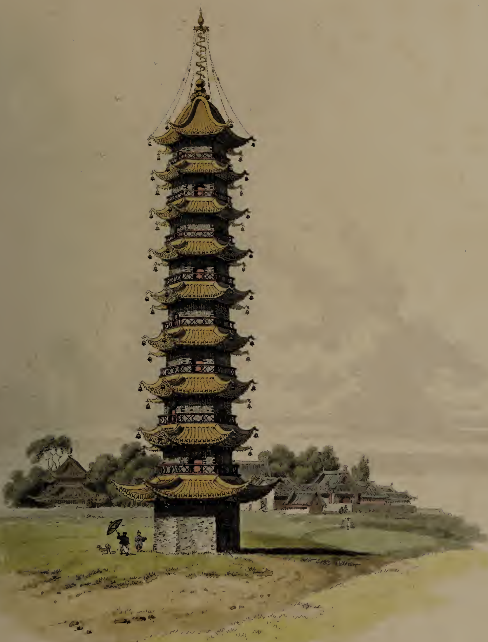
2. Finished July 2, 1876 by N. C. Tallmull.