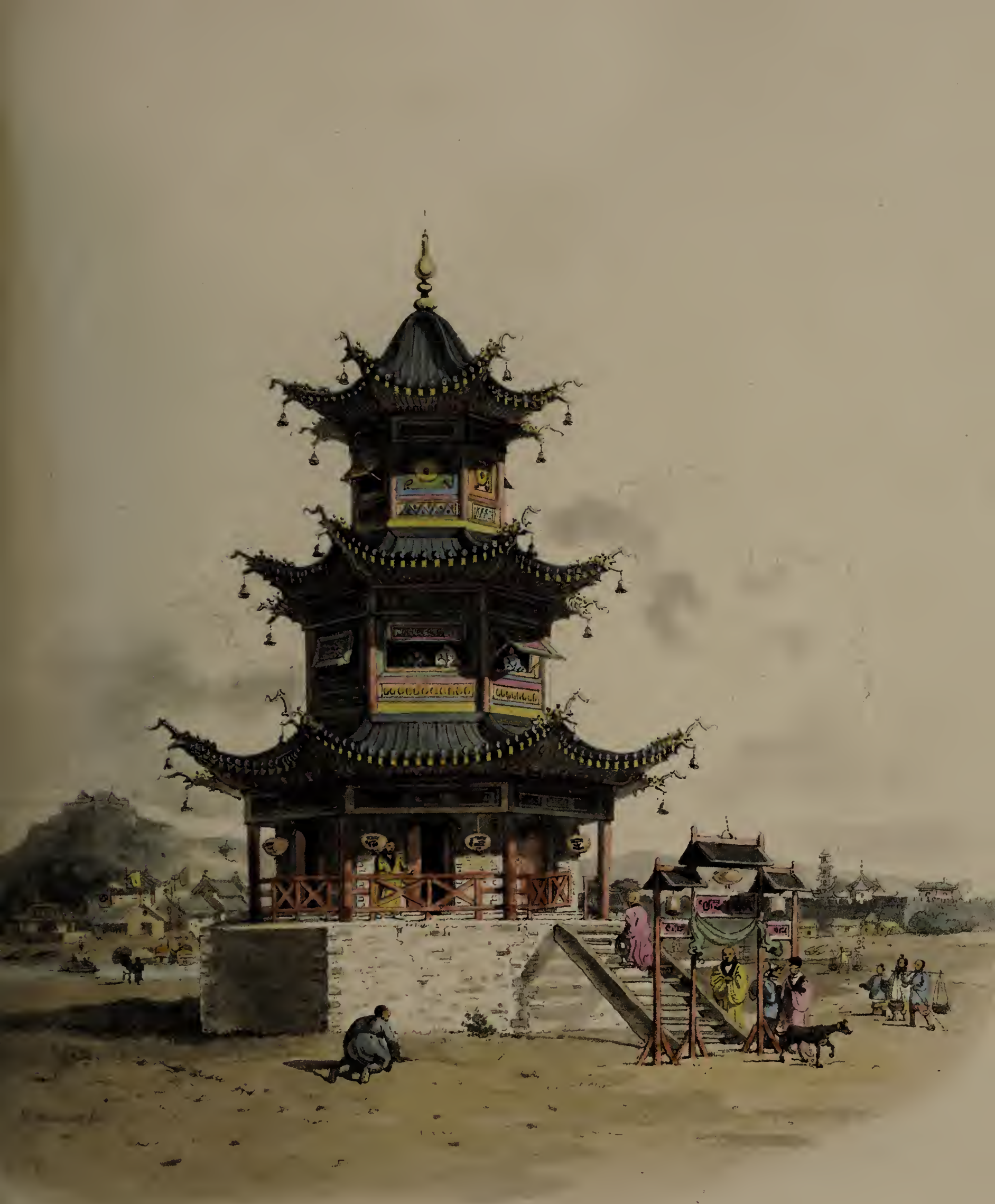
Landscape with Pagoda by the Sea and the Temple